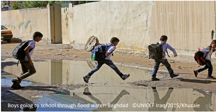
Boys going to school through flood water: Baghdad