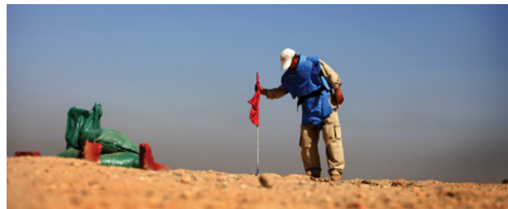
Marking mines in the Safwa area. Photo by: UNDP Iraq, Basra, Southern Iraq, 2011

Contamination is also delaying the oil sector's reconstruction and production. However, under the terms of contracts signed with the Government of Iraq, oil companies are obliged to survey and clear any areas relevant to oil production that are suspected of being contaminated.