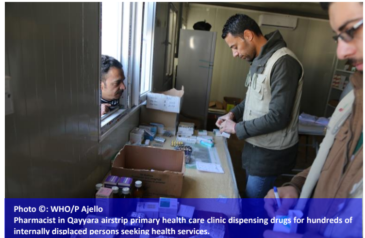
Pharmacist in Qayyara airstrip primary health care clinic dispensing drugs for hundreds of internally displaced persons seeking health services.