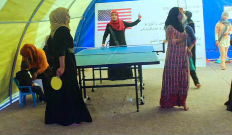
Above: Displaced children and young women at Hassan Sham Camp, east of Mosul, play table tennis and engage in other recreational activities at IOM's Psychosocial center —supported by the USAID Office of Foreign Disaster Assistance (OFDA).