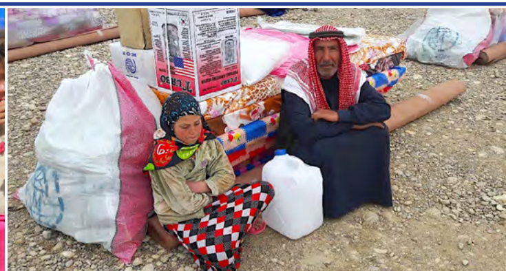
Above : A displaced family in Kirkuk., after fleeing ISIL-controlled Hawija, southwest of Kirkuk. Dozens of families continue to flee Hawija every week. IOM transports these families from two checkpoints, Maktab Khaled and Dibis, both west of Kirkuk, to the camps in Kirkuk. IOM also provides them with non-food items.