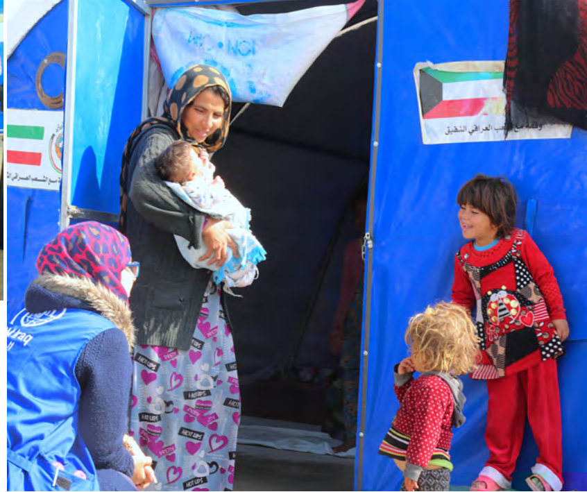
Right (©Hassan Almahmoud/IOM Iraq): On 10 March, displaced Iraqis from west Mosul moved into recently installed Kuwait-funded tents with WASH facilities at Qayara and Haj Ali emergency sites. Currently, Qayara Airstrip, with 10,000 plots, is completed and full. At Haj Ali, construction for additional 5,300 plots is ongoing to complete 7,500 plots. The two sites accommodate 63,718 IDPs as of 22 March.