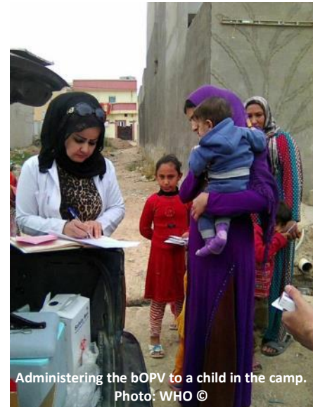
Administering the bOPV to a child in the camp.