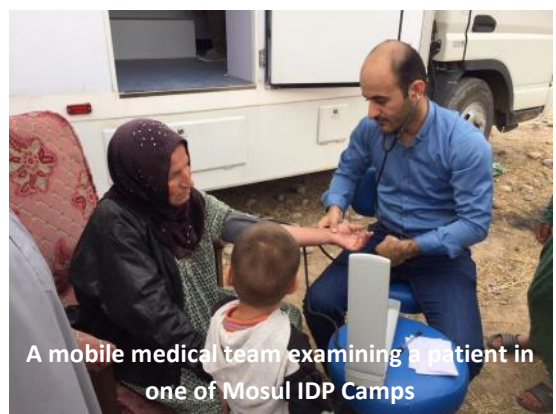
A mobile medical team examining a patient in one of Mosul IDP Camps