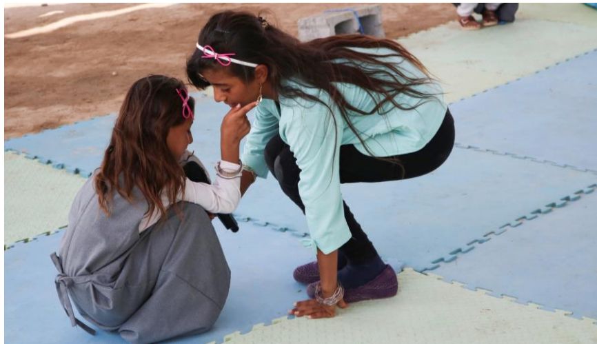
Children in Debaga IDP camp perform a play about being displaced and, ultimately, reunited with family.

includes 436 separated children (174 girls) and 138 unaccompanied children (27 girls) identified in August alone. This year, 3,060 separated children (1,324 girls) and 489 unaccompanied children (109 girls) received family tracing and reunification services. Ensuring quality of data for reunification of UASC remains challenging, as does gathering of accurate figures on children in alternative care. UNICEF is working with partners to ensure data is cleaned and verified before reporting. Dedicated provision of technical support and mentoring to partners undertaking Family Tracing and Reunification (FTR) remains a gap. UNICEF and the child protection sub-cluster (CPSC) with the support of partners has provided temporary human resource support, and is now working to identify a dedicated person to more sustainably address this need. Although the number of reports of child casualties has significantly dropped since the main military operations in Mosul finished, the Monitoring and Reporting Mechanism (MRM) continued to receive reports of child deaths and injuries due to conflict. In the month, the MRM verified the case of 14 boys who had been recruited and used in combat by ISIL.