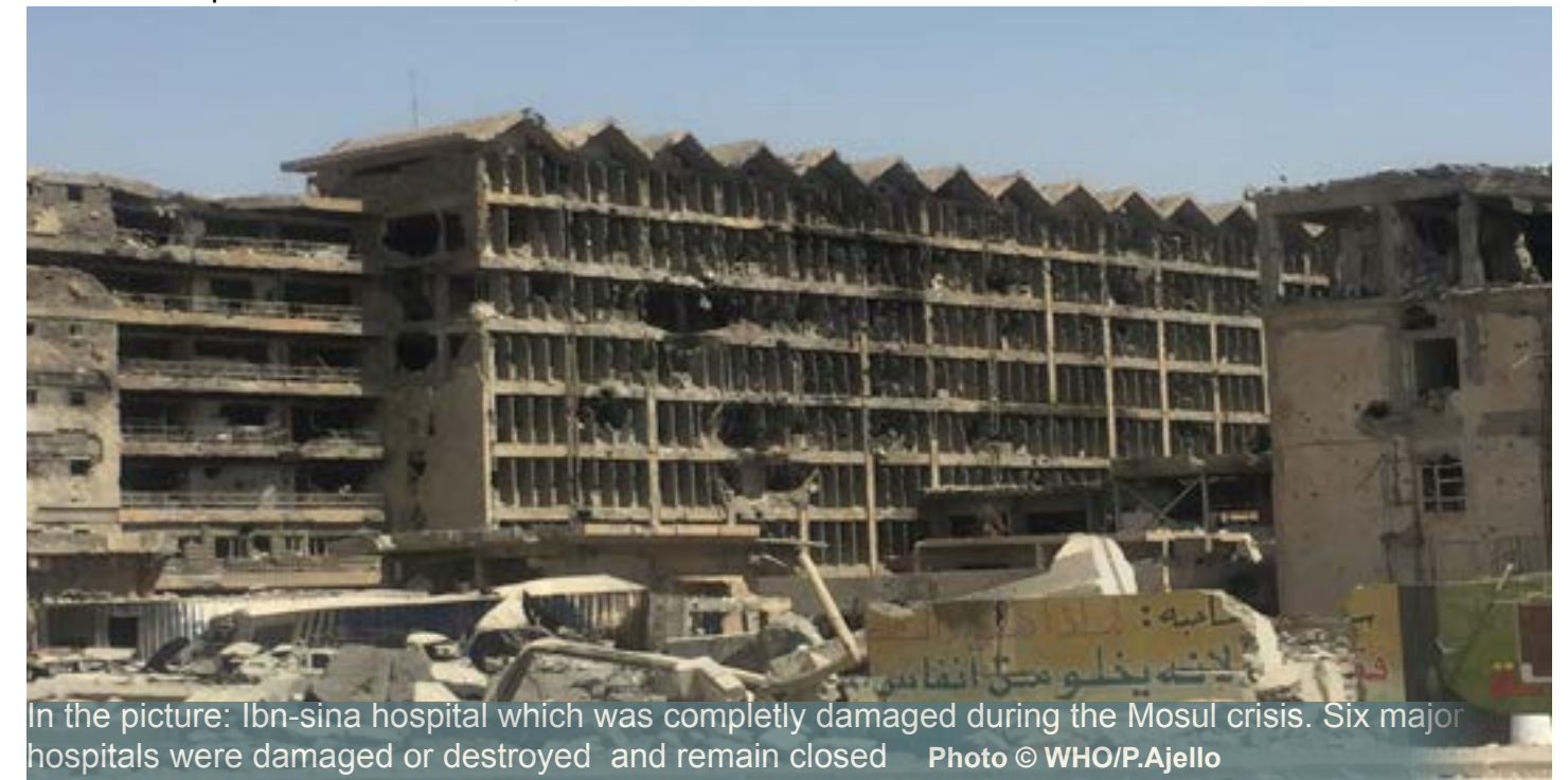
In the picture: Ibn-sina hospital which was completely damaged during the Mosul crisis. Six major hospitals were damaged or destroyed and remain closed

■ Iraq is endemic for cholera. In 2017, sporadic cases were recorded but were managed through close coordination between the Health, Water, Sanitation and Hygiene (WASH) cluster and Ministry of Health. In camps however, under suitable conditions, there should not have been any cases, but these were still recorded due to some under causative factors that have since been dealt with through the national cholera taskforce. Furthermore a cholera lessons learnt workshop was conducted to focus on the preparedness and response activities for cholera for the next year.