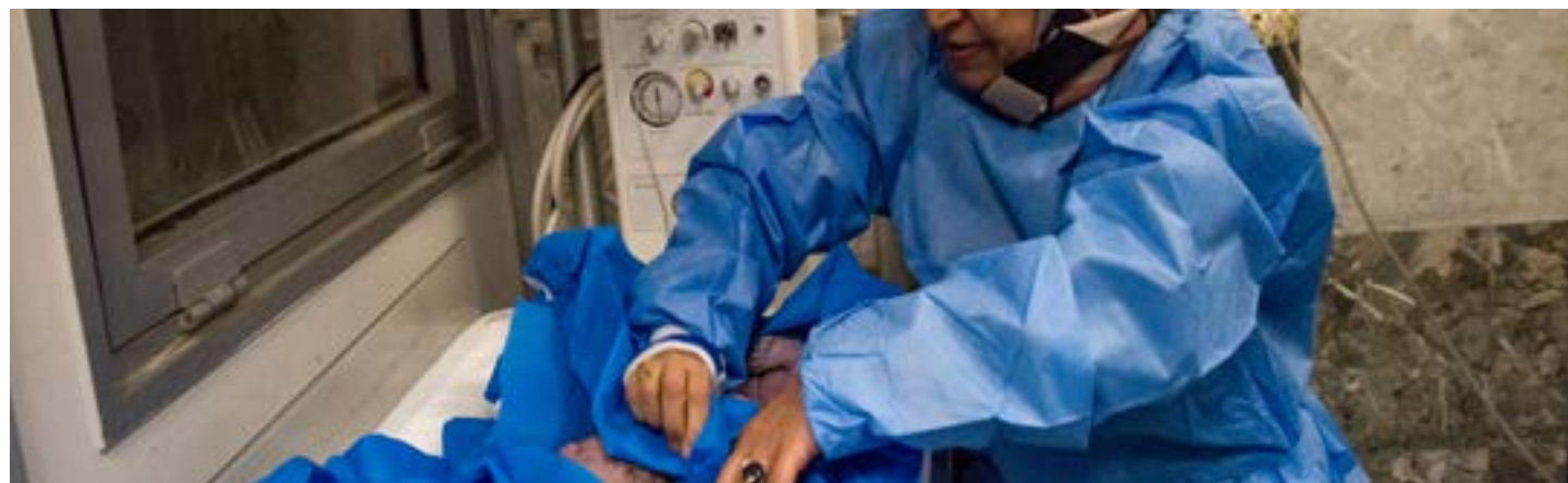
A medical personnel attends to a new born baby in one of the UNFPA supported health facilities

UNFPA also provided training on the Minimum Initial Service Package (MISP) in reproductive health to different health actors, training more than 150 providers in 2017, as well as trainings on clinical management of rape. Additionally, UNFPA provided emergency reproductive health kits to the different RH working group partners. The working group also endorsed the guidelines to work towards the harmonization of services among different actors.