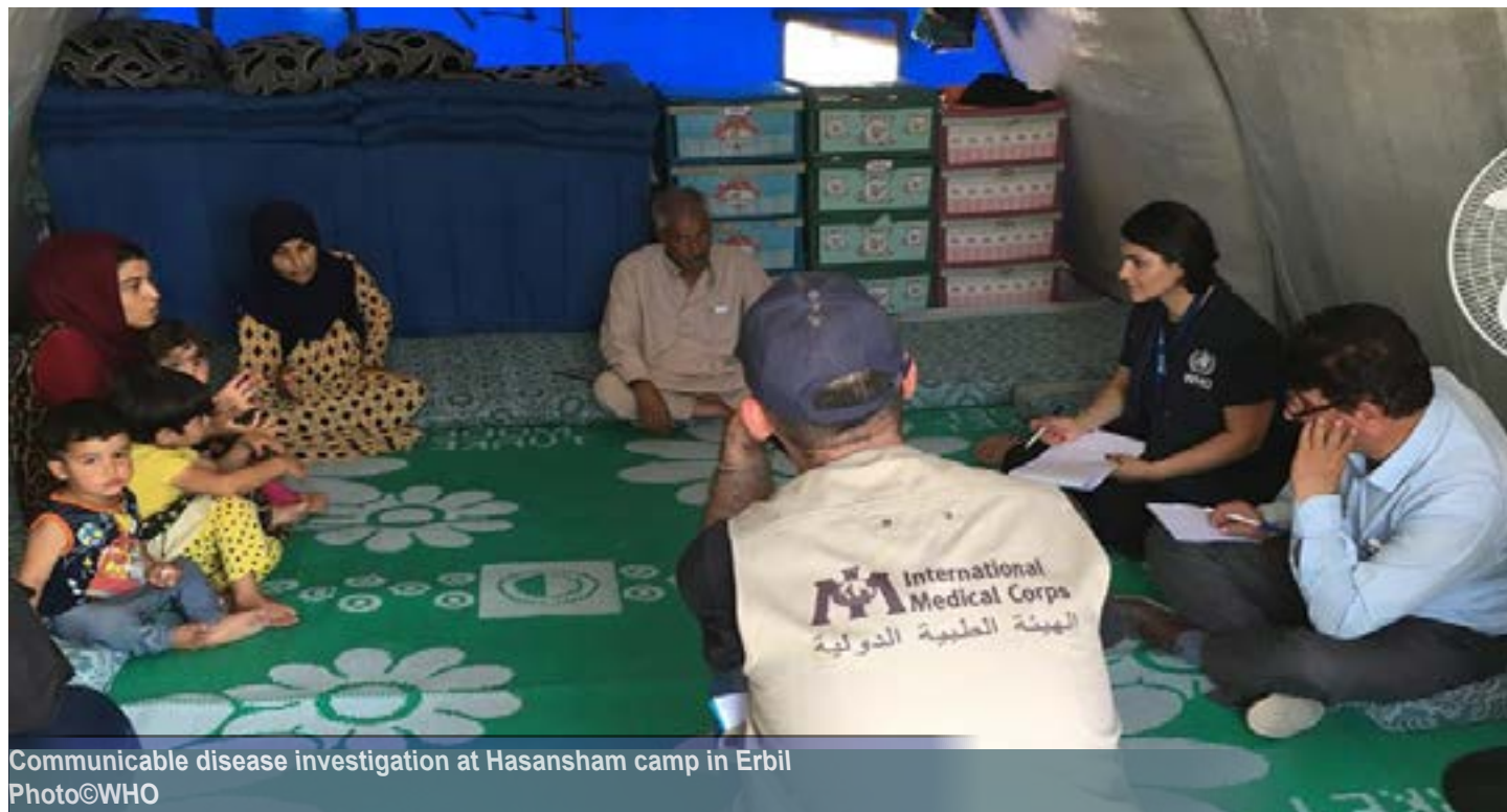
Communicable disease investigation at Hasansham camp in Erbil

The SAG was instrumental in the strategic and technical reviews of the projects submitted under the Humanitarian Pooled Fund (HPF) that had three allocations during 2017 (First Standard, Reserve and Hawija). This is in addition to supporting the development of the health component of the HRP 2018, including both the Humanitarian Needs Overview (HNO) and the Response Plan.