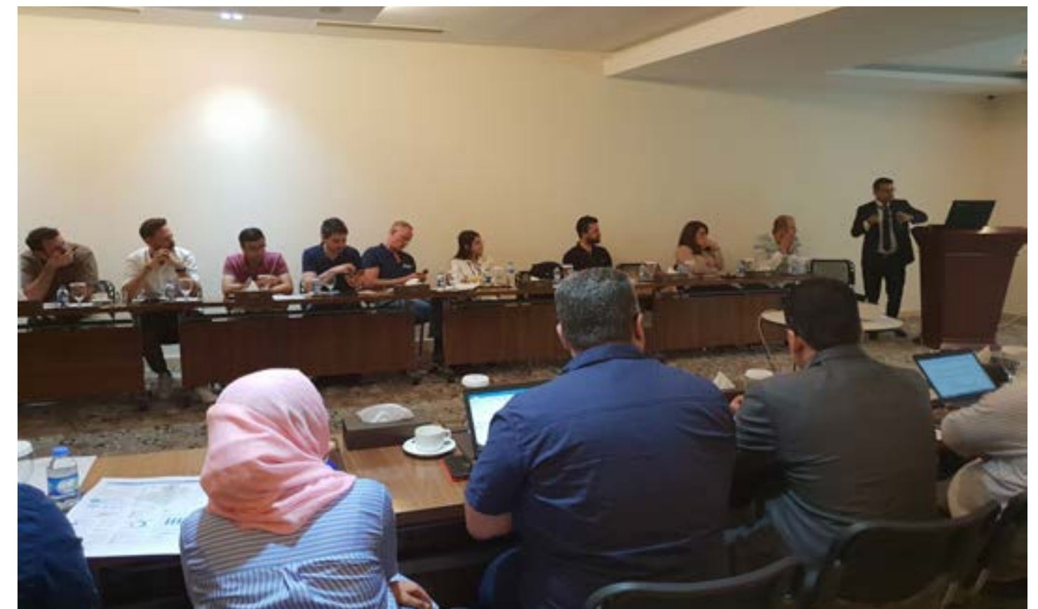
Health cluster partners discussing the indicators for HRP 2018 in Erbil

The health cluster had requested USD 109.6 million under the HRP 2017 and, by the end of the year, was fully funded. In order to develop the health section of the HNO and HRP 2018, the cluster used a participatory approach, incorporating feedback from the SAG members. In addition, the cluster conducted a workshop for all partners on 14th November, in which the objectives, activities and indicators to be included, monitored and reported against for 2018 were discussed and finalized.