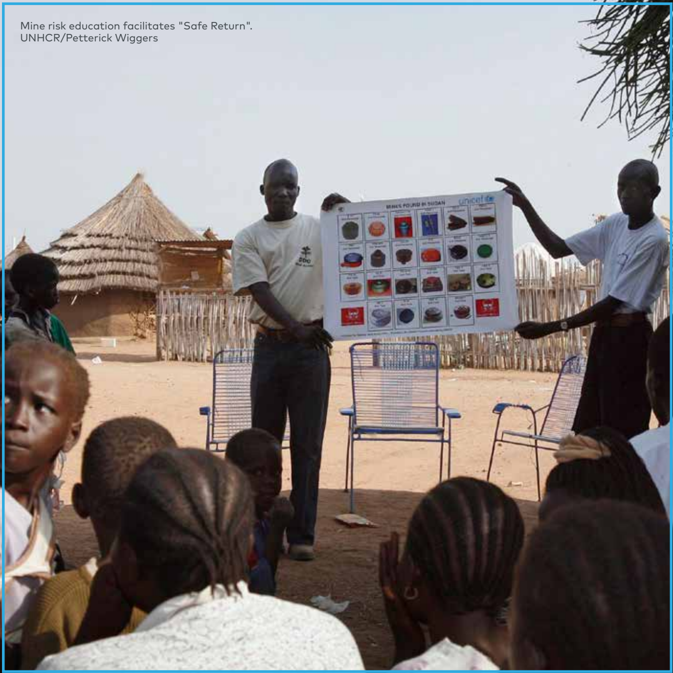
Mine risk education facilitates "Safe Return".